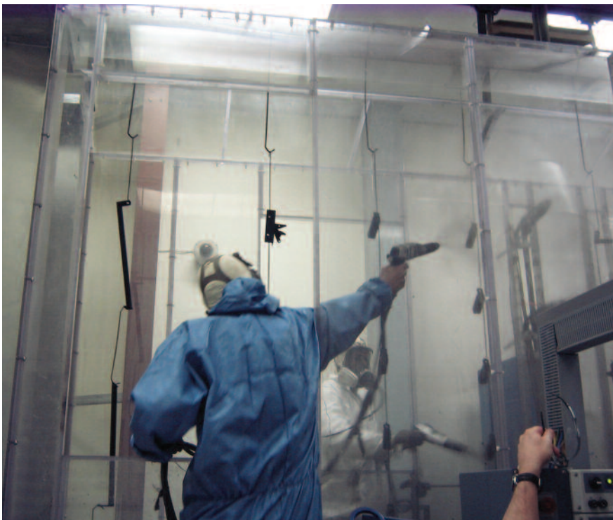
Powder coatings that provide maximum protection from the hot Nevada sun are applied in a temperature-controlled environmental room.

Once AR Iron started getting requests for powder coating, though, it had to start seriously thinking about an in-house system. “During those times, we would push out 3,000 to 4,000 linear feet of rail every week to 2 weeks,” Sclafani said. “We were pumping. We were moving.”